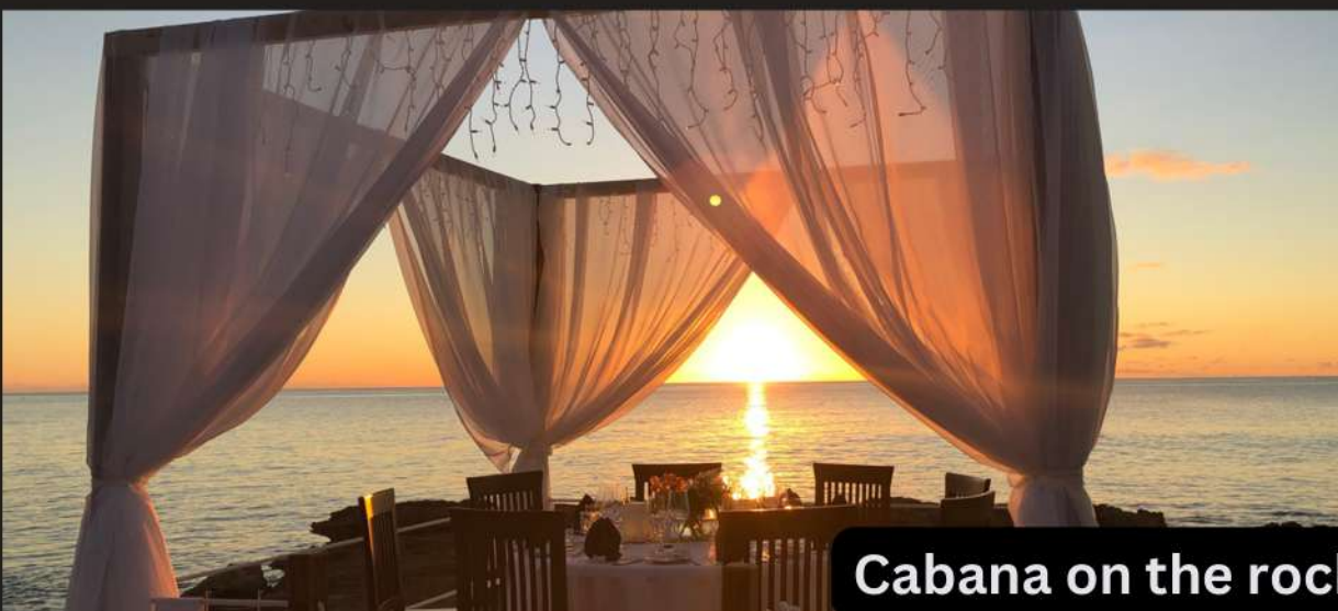
Cabana on the rocks